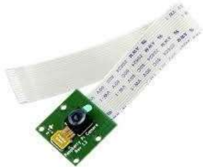
Fig. 3 Camera Module

The Raspberry Pi Camera Module is a custom designed add-on for Raspberry Pi. It attaches to the Raspberry Pi by way of one of the two small sockets on the board upper surface. This interface uses the dedicated CSI interface, which was designed especially for interfacing to cameras. The CSI busses is capable of extremely high data rates, and it exclusively carries pixel data.