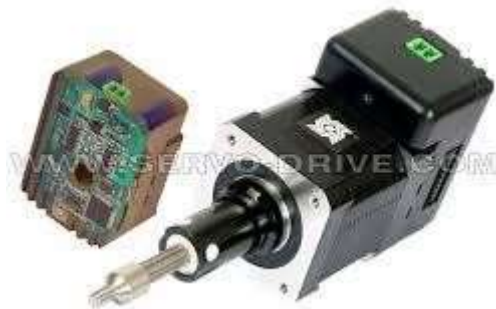
Fig. 4 Stepper Motor

A stepper motor is a brushless, and can be both synchronous as well as asynchronous electrical motor. Due to this, the motor can convert digital pulses into mechanical rotations. When the motor revolves, its revolutions are divided into particular steps, and hence it is known as stepper motor. These steps are discrete and for every step the motor is sent a pulse. All steps of the stepper motor are equal and they are divided for unit time.