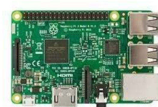
Fig. 2 Raspberry Pi

Raspberry Pi board is a micro-controller board used for development of various embedded level projects. Its size is no more than a credit card. It has a Broad-com BCM2835 system on chip (SoC) multimedia processor. It also has 512 MB memory chip on the board at the centre. Its IAS (Instruction Set Architecture) is different than other architectures and it is used for ARM (Advanced RISC Machines). The Raspberry Pi runs on Raspberry Pi compatible operating system which is known as GNU/Linux Raspbian. Operating systems like windows, IOS are also compatible to Raspberry Pi. But