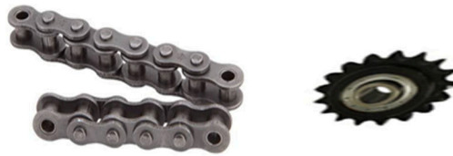
Fig. 3 Chain and Sprocket

Sprocket is connected to shaft for rotation and industrial chain is mounted on it to transmit power. The dc motor is connected to the driver sprocket. Power will transmit from driver sprocket to driven sprocket through industrial chain.