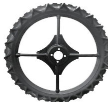
Fig. 5 Hub Wheel

The wheels are mounted on chassis frame with the help of axle. There are four wheel provided on it, two are bigger in size are mounted on rear side of frame and another two small wheel are in front of frame. Bearing is provided in wheel for reducing man effort to pushing machine.