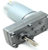
Fig. 2 DC motor

DC motor is mounted on body which is connected to sprocket for power transmission purpose. There are two motor are mounted on body which will run by chargeable battery. Dc motor used to transmit direct current electrical energy into mechanical energy.