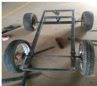
Fig. 1 Frame

A consists of an internal framework that supports a man-made object in its construction and use. The chassis is considered to be one of the significant structures of an automobile. It is the frame which holds both the body of machine and the power. Various mechanical parts like, hub wheel, DC motor 12v, chain and sprocket, bearing, chargeable battery are bolted onto the chassis.