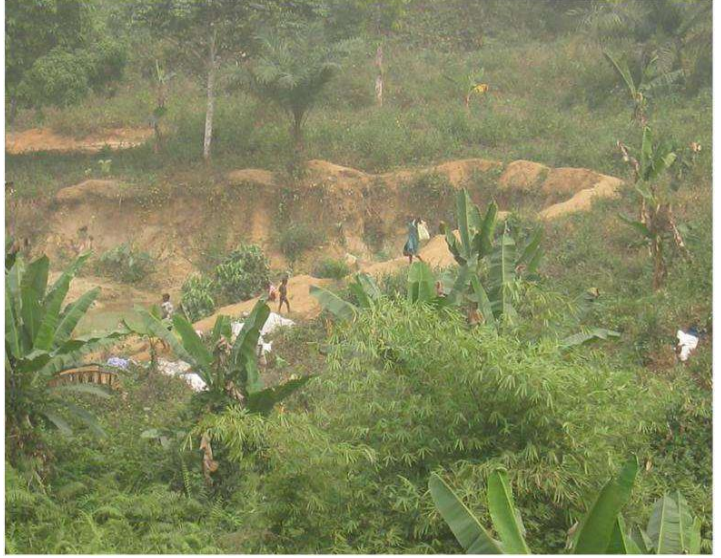
Fig. 2.3 Farm Erosion in Anambra, South East, Nigeria

Okogbue and Ezechi [15] confirmed that erosion menace is viewed from two main perspective, firstly as a natural phenomenon which is a fundamental process for the formation and modification of land forms on earth surface according to their geotechnical characteristics of soils susceptible to severe gullying. The second perspective is the human