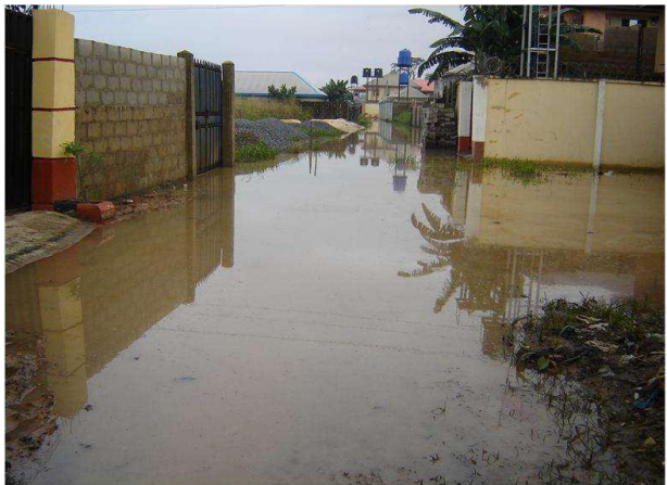
Fig. 2.1 Urban Flooding in Yenagoa, Bayelsa State, Nigeria

Structural measures (defense structures) will remain important elements and should primarily focus on the protection of human health and safety, and valuable goods and property. We will have to keep in mind that flood protection is never absolute, and may generate a false sense of security. The concept of residual risk, including potential failure or breach, should there-fore be taken into consideration.