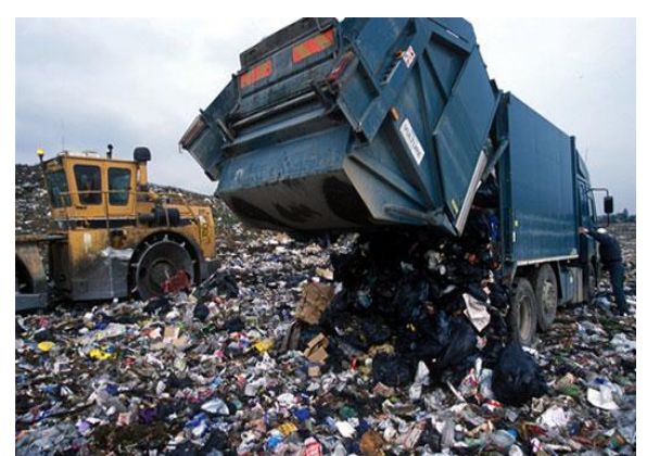
Fig. 2.3 A dump site for solid waste disposal in Lagos State

Improper waste disposal and lack of reliable transport infrastructure means that collected wastes are soon dispersed to other localities. Another unwelcome practice is to overload collection trucks with 5-6 tons of waste to reduce the number of trips; this has necessitated calls by environmental activist to prevail on the relevant legislature to conform to the modern waste transportation standard.