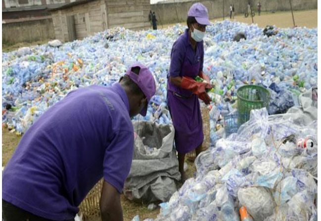
Fig. 2.7 Sorting of bottles for Recycling in Lagos State

Formulation of recycling clubs in secondary schools to instill recycling habit in young people