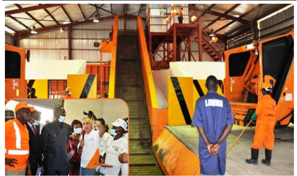
Fig. 2.6 LAWMA workers on duty in Lagos State