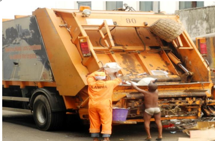
Fig. 2.5 Waste Collection in Lagos State

The Lagos State Government through LAWMA engages, coordinates and evaluates the activities of its private sector participant (they are over 300) into Municipal Solid Waste Collection. Collection frequency is either once or twice a week and usually on door –to-door basis. This is usually difficult in densely populated areas and it not uncommon that collection frequency is elongated.