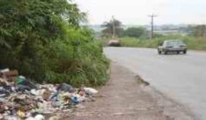
Fig. 2.1 A dump site for solid waste

Until recently, the concept of land filling was used to dump waste material for disposal. Therefore, not much care was taken about their construction. Placing the waste in the Earth's upper crust was considered as the safest practice of waste disposal. But with rapid industrialization and urbanization, land filling has metamorphosed. As uncontrolled landfills have shown potential of polluting various parts of the environment and many accidents have also happened, regulations have been imposed on landfill location, site design and their preparation and maintenance. A certain degree of engineering was made mandatory for landfills.