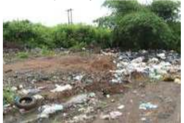
Fig. 2.2 A dump site for solid waste affected by rainfall