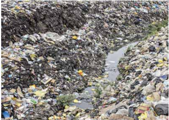
Fig. 2.4 A dump site for solid waste disposal in Oyo State

generators feels that the amount being charged by the waste franchisee is beyond their means, they dump the waste along flood paths thus compounding the waste predicament.