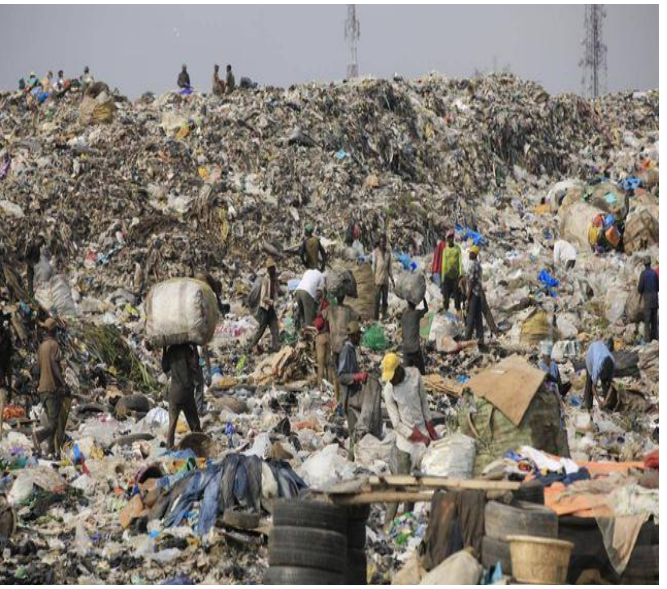
Fig. 2.9 Example of Open dumping Site in Nigeria