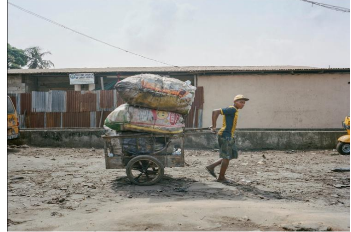
Fig. 2.8 Conveying of Solid Wastes by Scavenger of r Recycling

The Informal recycling sector is very active in waste management system in Nigeria. We have them either as itinerant waste buyers or scavengers and they target valuable materials such as plastics, paper, used electronic electrical equipment, glass, metal etc. Their activities have great impact in the reduction of the net volume of waste disposed of. However their importance, there is no formal integration of this stakeholder into the system except in Lagos State.