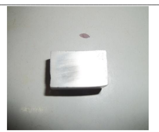
Fig. 5 MMC sample prepared for hardness test