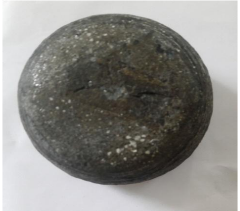
Fig. 3 MMC (AA6351+ 5% of Al<sub>2</sub>O<sub>3</sub>)