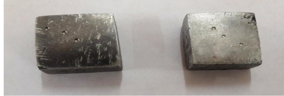
Fig. 10 MMC sample after indentation on hardness testing machine

The hardness test was carried on Rockwell Hardness testing method. For hardness testing, the samples of AA6351/2.5, 5, 7.5% wt. Al_2O_3 composite were prepared as per dimension (10 mm x 10 mm x 25 mm) as ASTM E18-05, standard.