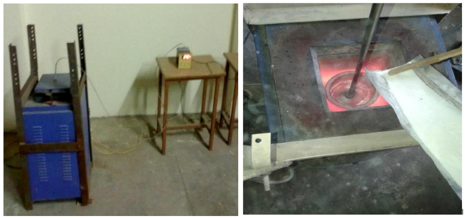
Fig. 1 a. Muffle furnace

Fig. 1 b. Preparation of sample by stir casting