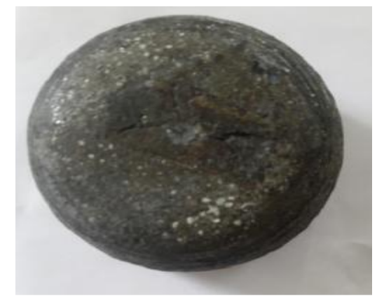
Fig. 4 MMC (AA6351+7.5% of Al<sub>2</sub>O<sub>3</sub>)