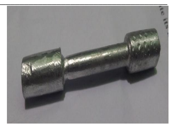
Fig. 6 MMC sample for tensile test