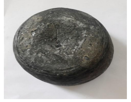
Fig. 2 MMC (AA6351+2.5% of Al<sub>2</sub>O<sub>3</sub>)

Now the mixed composite after cooling and solidification is cut into desired shapes for testing mechanical properties on the band saw machine. The machine is an electrically driven machine which is used to cut the hard composites. The MMC samples prepared are shown in figures given below.