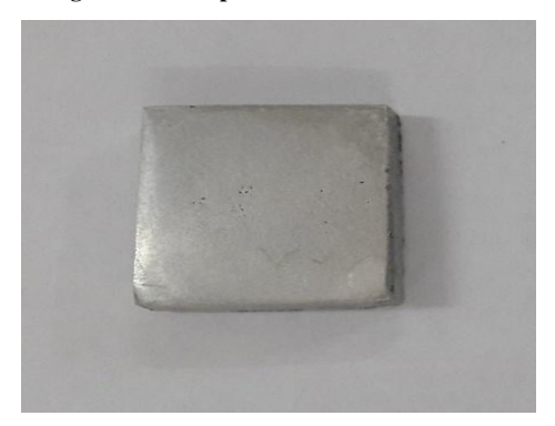
Fig. 8 MMC sample prepared for microstructure